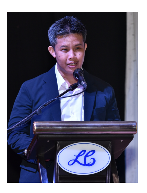
Malaysian nationals who were ITEC Alumni, sharing their experience of attending ITEC Courses in India with the audience