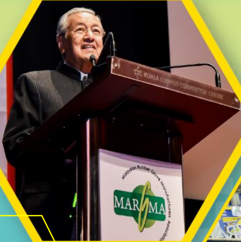
Tun Dr. Mahathir bin Mohamad Prime Minister of Malaysia