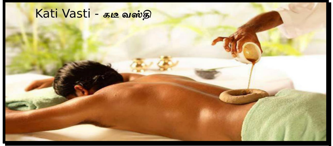
It is done for the patients, suffering from the following conditions